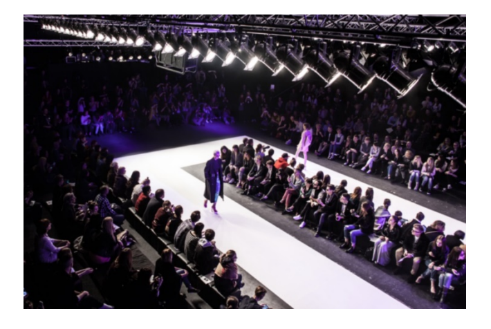
Page | 4 2021/06667D/V1.0/20210901

Your Statement of Fact is Your copy of the information You have declared to Us. It is this information which We have based Our decision to provide You with the insurance or a quotation. It is vital that You make sure the information contained within this document is correct.